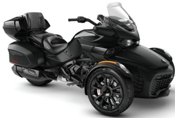
■ MONOLITH BLACK SATIN DARK*