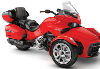
■ PLASMA RED PLATINUM*