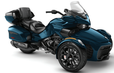
■ PETROL METALLIC DARK*