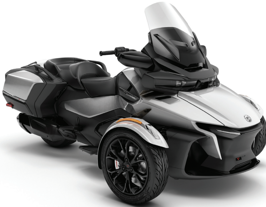
■ HYPER SILVER