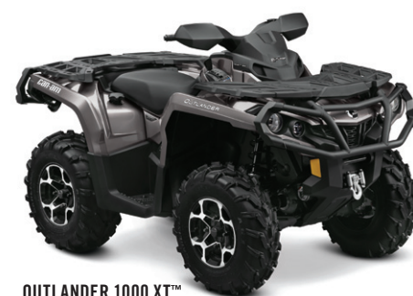
OUTLANDER 1000 XT™