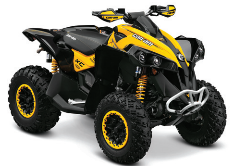
RENEGADE 800R X™ xc