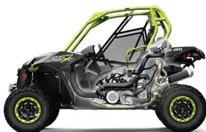
121-HP ROTAX 1000R TURBOCHARGED ENGINE