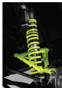
FOX 2.5 PODIUM RC2 HPG REAR SHOCKS WITH BOTTOM-OUT CONTROL AND SPRING CROSSOVER