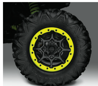
14-IN. ALUMINUM BEADLOCK WHEELS 28-IN. MAXXIS BIGHORN 2.0 TIRES