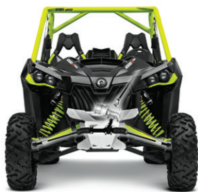
TRI-MODE DPS WITH QUICK-RATIO STEERING