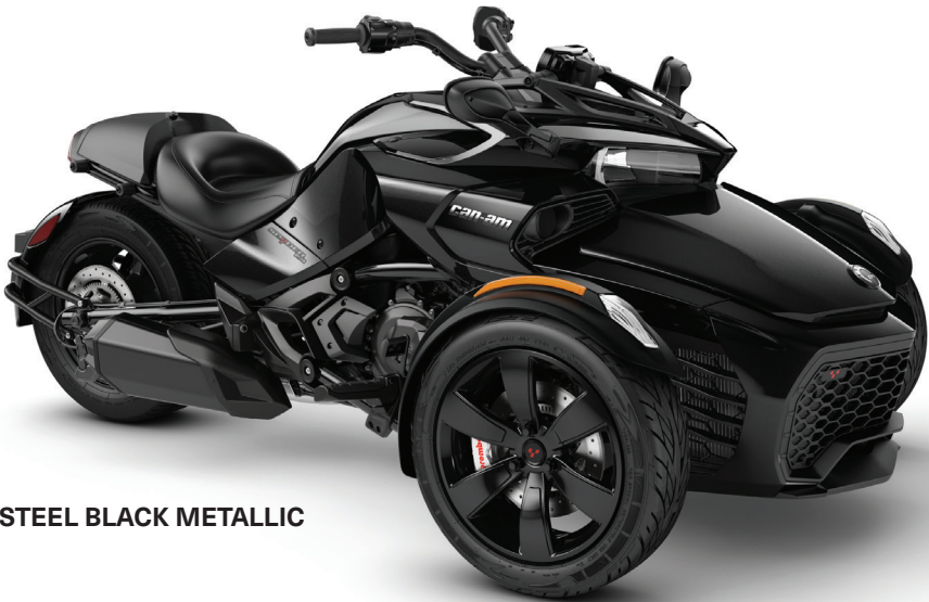
STEEL BLACK METALLIC