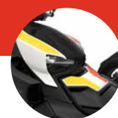
Heritage White IV