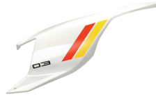
Heritage White II