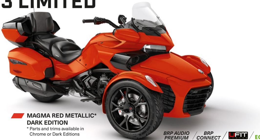
MAGMA RED METALLIC* DARK EDITION

* Parts and trims available in Chrome or Dark Editions