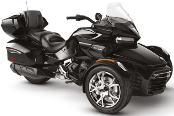
STEEL BLACK METALLIC* CHROME EDITION