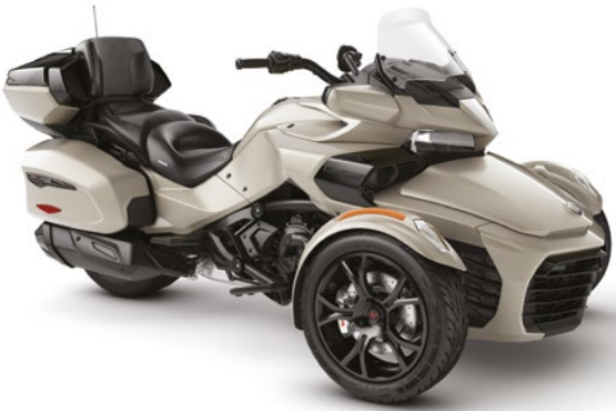
LIQUID TITANIUM* DARK EDITION