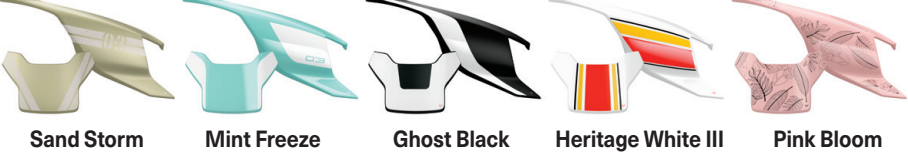
Sand Storm Mint Freeze Ghost Black Heritage White III Pink Bloom