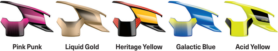
Pink Punk Liquid Gold Heritage Yellow Galactic Blue Acid Yellow