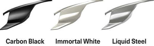
Carbon Black Immortal White Liquid Steel