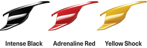
Intense Black Adrenaline Red Yellow Shock