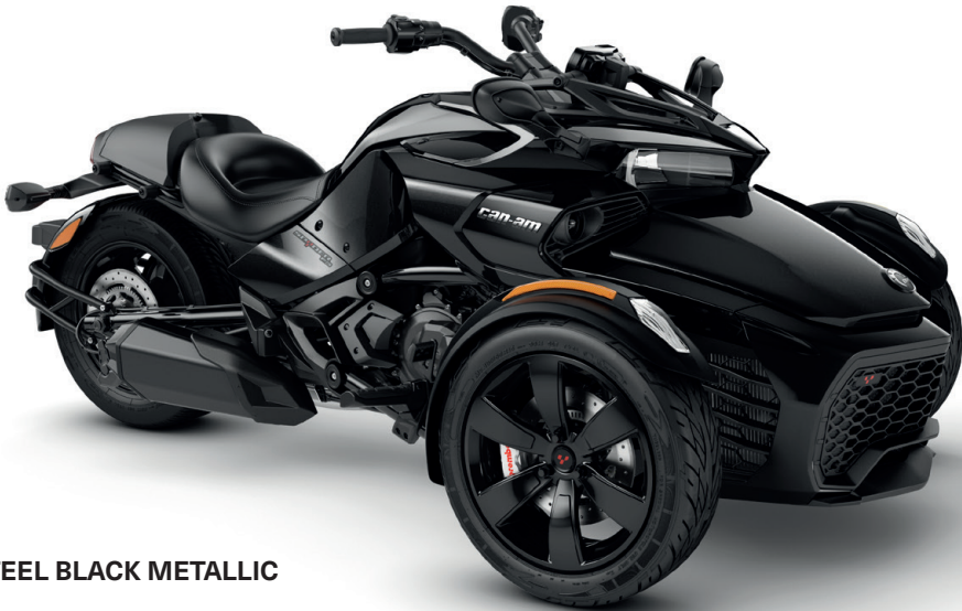
STEEL BLACK METALLIC