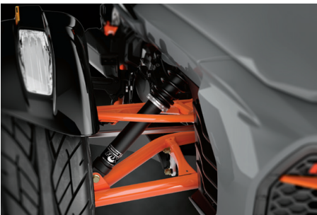
FOX® SHOCKS Sport-tuned, gas-charged front shocks give you a responsive, sporty feel and great performance on the most demanding roads.