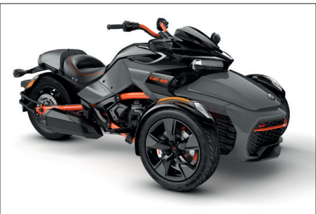
SPECIAL SERIES A special package for the sport enthusiasts that comes pre-equipped with several accessories.