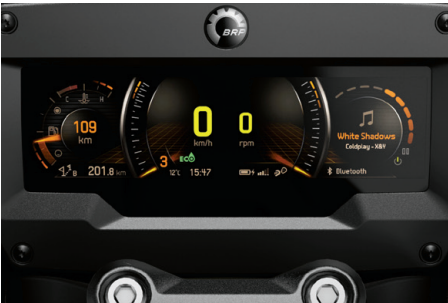
DIGITAL GAUGE Large panoramic 7.8" wide LCD color display on Special Series.