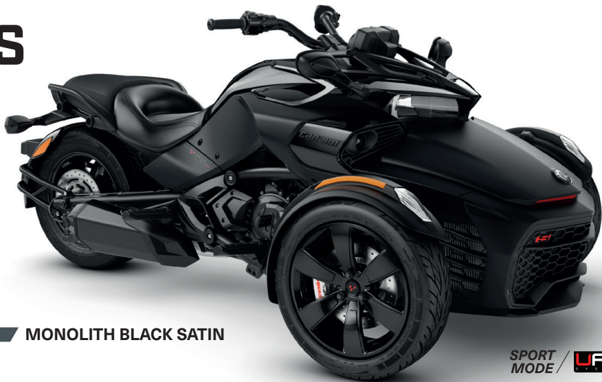
MONOLITH BLACK SATIN