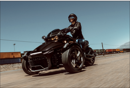
VSS Vehicle Stability System that uses a variety of technologies, including SCS / ABS / TCS, to monitor the vehicle and keep the rider confident on the road.