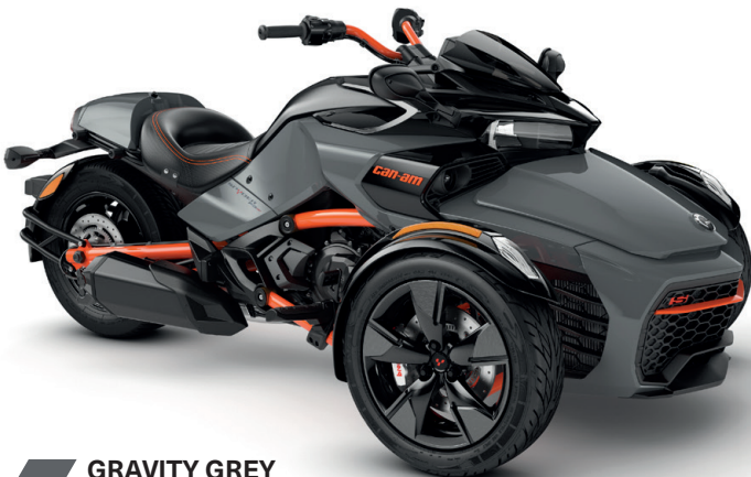
GRAVITY GREY SPECIAL SERIES