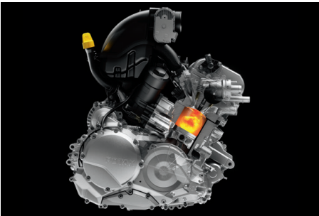
ROTAX 1330 ACE ENGINE 115 hp engine – More power can only mean one thing – better performance. Our most powerful engine allows you to challenge the road knowing you have the horsepower you want when you need it.