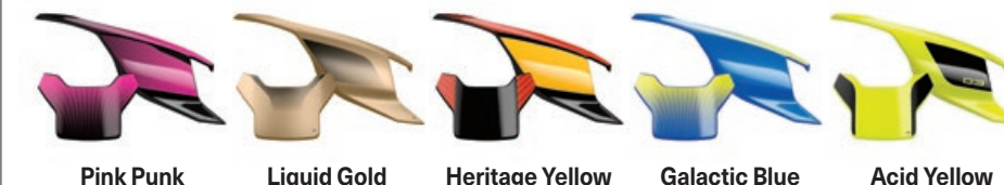
Pink Punk Liquid Gold Heritage Yellow Galactic Blue Acid Yellow