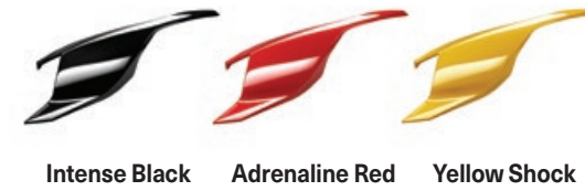
Intense Black Adrenaline Red Yellow Shock