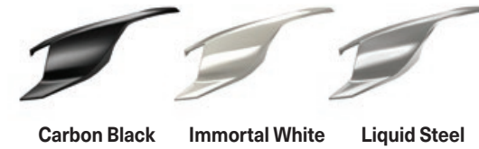
Carbon Black Immortal White Liquid Steel