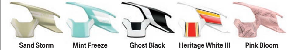
Sand Storm Mint Freeze Ghost Black Heritage White III Pink Bloom