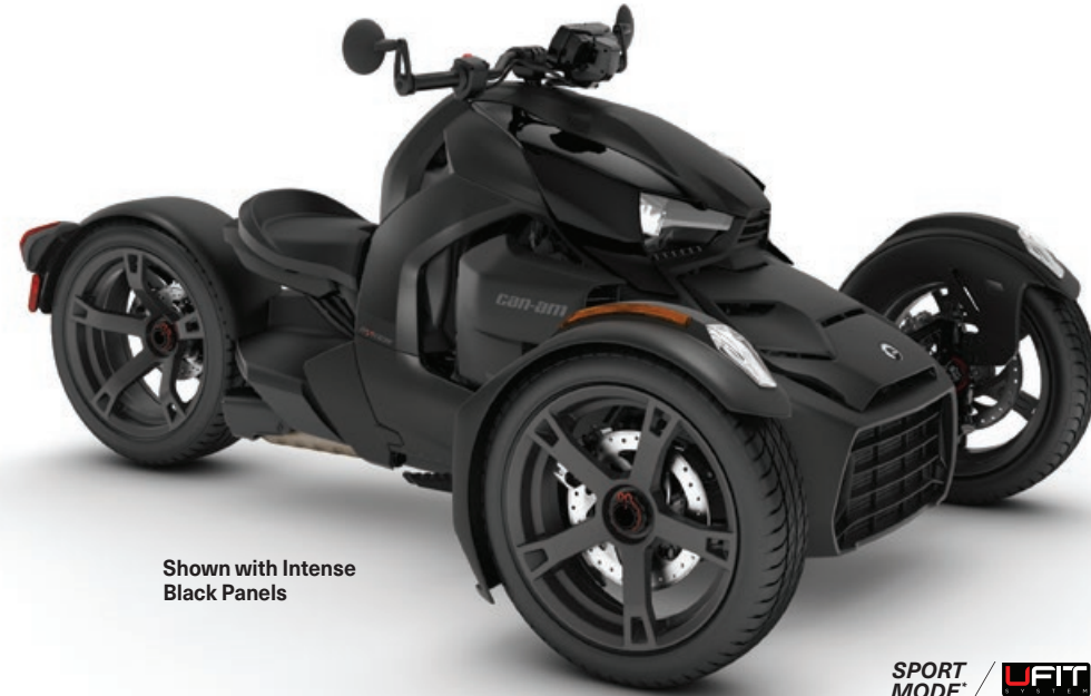
Shown with Intense Black Panels