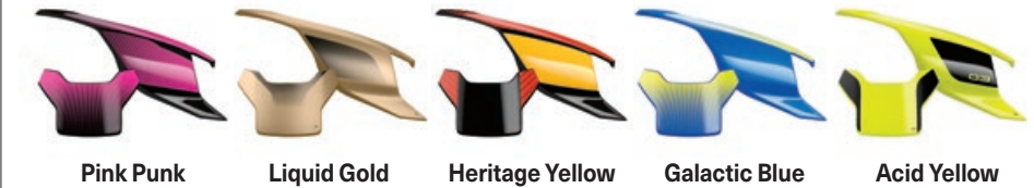
Pink Punk Liquid Gold Heritage Yellow Galactic Blue Acid Yellow