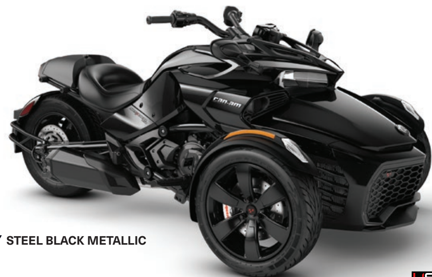
STEEL BLACK METALLIC