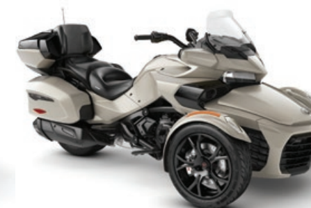
LIQUID TITANIUM* DARK EDITION