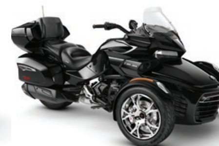
STEEL BLACK METALLIC* CHROME EDITION