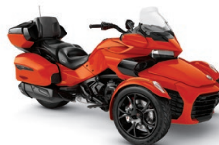
MAGMA RED METALLIC* DARK EDITION