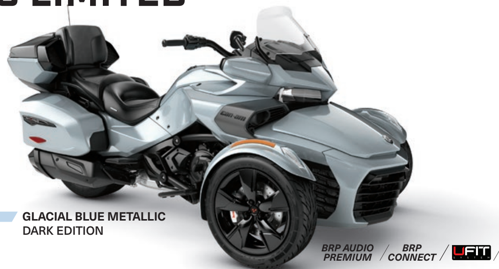
GLACIAL BLUE METALLIC DARK EDITION

BRP AUDIO PREMIUM / BRP CONNECT / UFIT / ECO