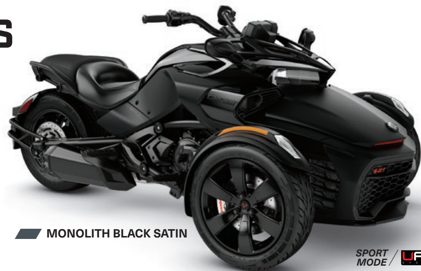
MONOLITH BLACK SATIN