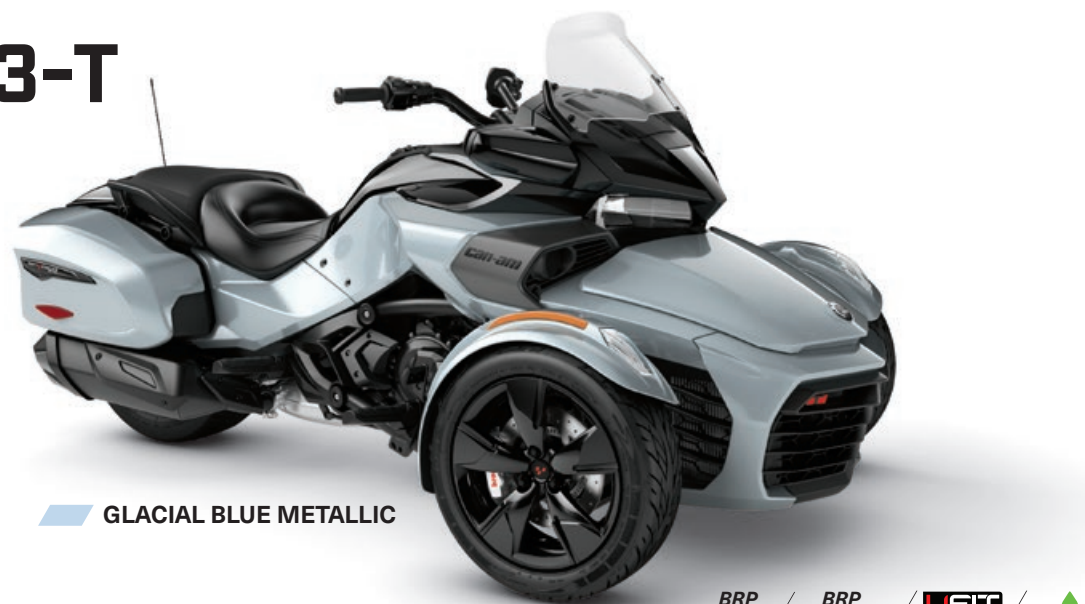
GLACIAL BLUE METALLIC