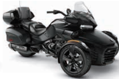
MONOLITH BLACK SATIN DARK*