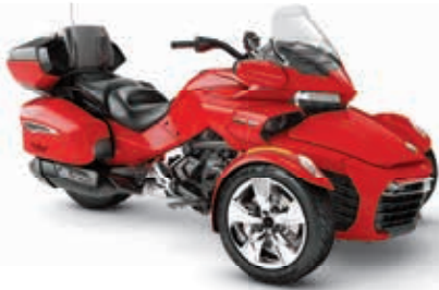
PLASMA RED CHROME*