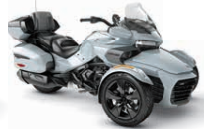
GLACIAL BLUE METALLIC DARK*