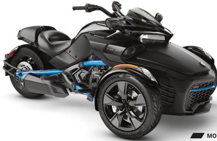
MONOLITH BLACK SATIN