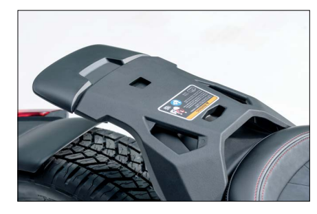
MAX MOUNT STRUCTURE

Front and rear KYB HPG shocks with remote adjusters and 1 inch of extra suspension travel to optimise your ride and improve comfort.