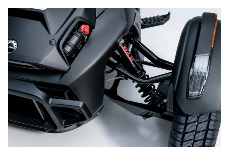
FULL KYB HPG SHOCKS

Unique sound signature and high-end exhaust.