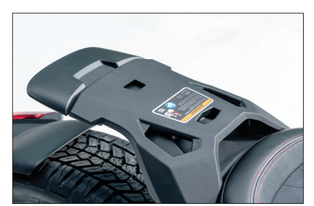
MAX MOUNT STRUCTURE

Front and rear KYB HPG shocks with remote adjusters and 1 inch of extra suspension travel to optimize your ride and improve comfort.