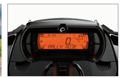
RALLY MODE AND TIRES

UNIQUE RALLY EXPERIENCE A vehicle designed for all-road trips with hand guards, rally comfort seat for a more reactive rider\ position\ and\ adjustable\ large\ anti-slip\ foot\ pegs.