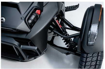
FULL KYB HPG SHOCKS

Unique sound signature and high-end exhaust.