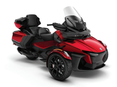
DEEP MARSALA METALLIC*