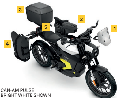
CAN-AM PULSE BRIGHT WHITE SHOWN