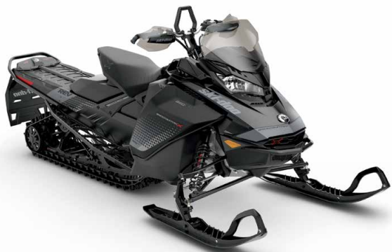
BACKCOUNTRY™ X® 850 E-TEC® shown