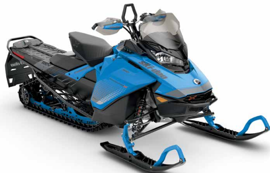
BACKCOUNTRY™ X® 850 E-TEC® shown