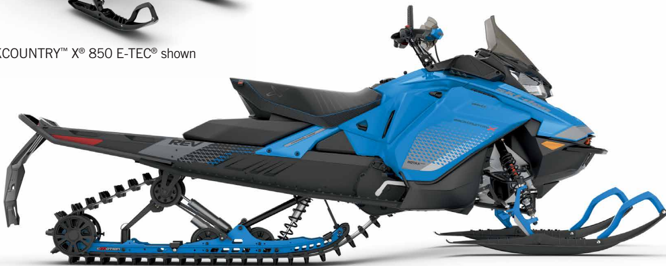
BACKCOUNTRY™ X® 850 E-TEC® shown