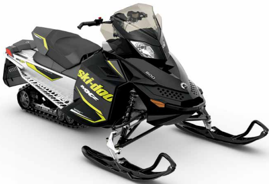
MXZ® SPORT 600 Carb shown