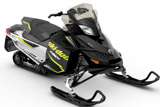
MXZ ® SPORT 600 Carb shown