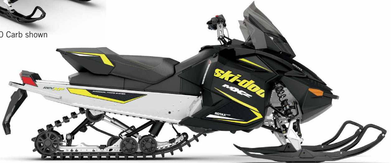
MXZ® SPORT 600 Carb shown